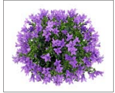
> 40 open flowers