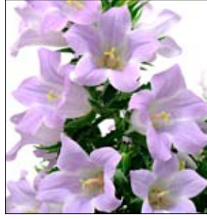
THE CROWN PRINCESS' BELLFLOWER®