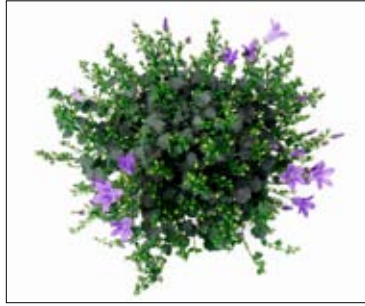
1 - 15 open flowers