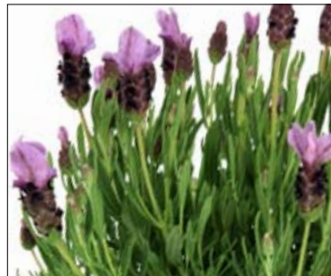
Bella Lavender - Close up