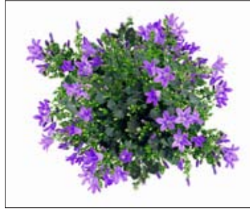
15 - 40 open flowers